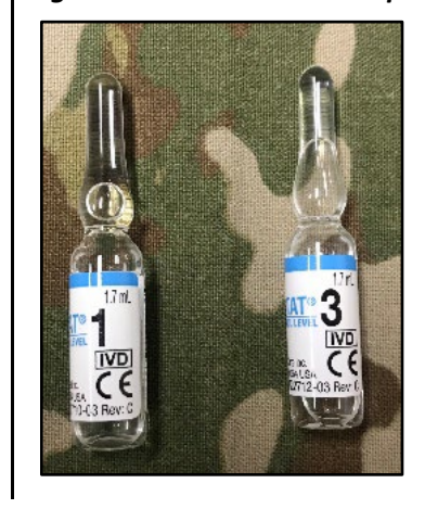
Figure C1. Level 1 and 3 ampules