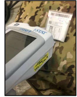
Figure A2. Proper cartridge handling