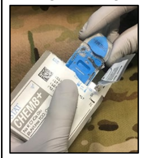
Figure A3 Loading cartridge sample well with blood