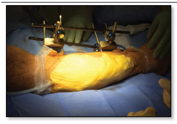
Placement of occlusive impermeable dressing, such as loban or Tegaderm, over the gauze/sponge and suction tubing.