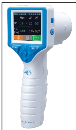
Figure 1. Pupillometer